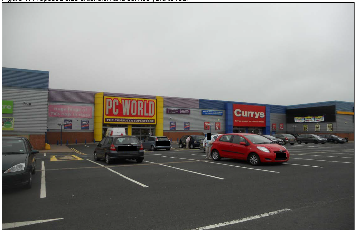
Figure 2: Existing units within Battery Retail Park

Figure 1: Proposed side extension and service yard to rear